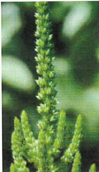
Waterhemp female seed head on left, male head on right.