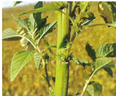
Female Palmer amaranth with spiny bracts. (B. Jenks, NDSU)