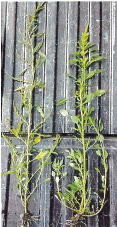
Palmer amaranth (right), waterhemp (left).