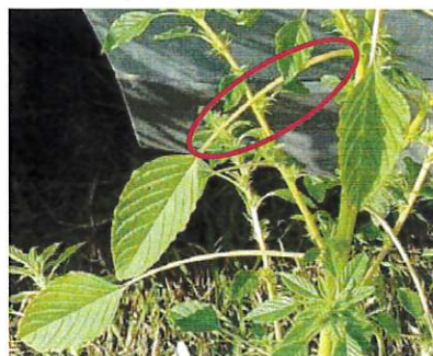
Palmer amaranth petioles are longer than the leaf blade.