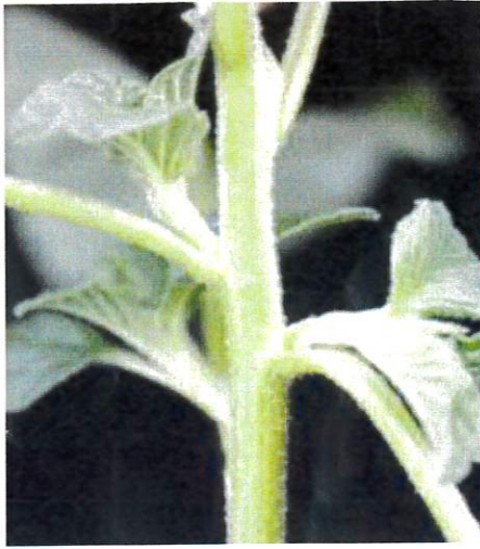
Palmer amaranth (left) has no hair, Redroot pigweed (right) has short, dense hair.