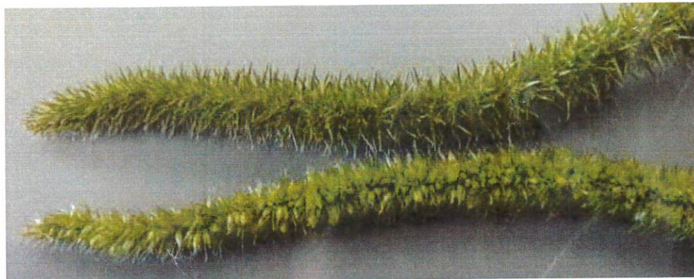
Palmer amaranth female seed head (top) and male (bottom). Female is prickly, male is soft.