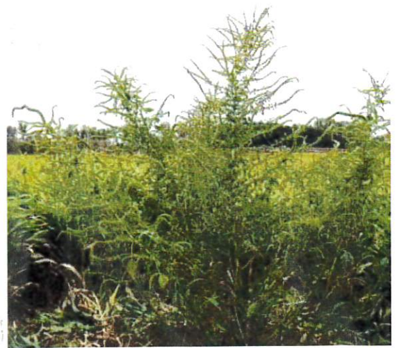
Palmer amaranth.