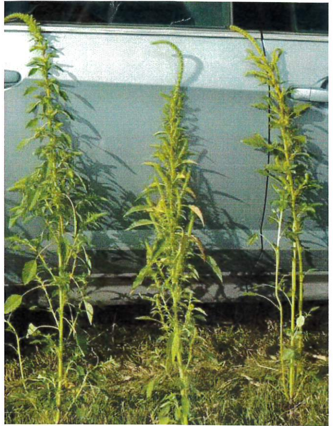
Palmer amaranth plants.