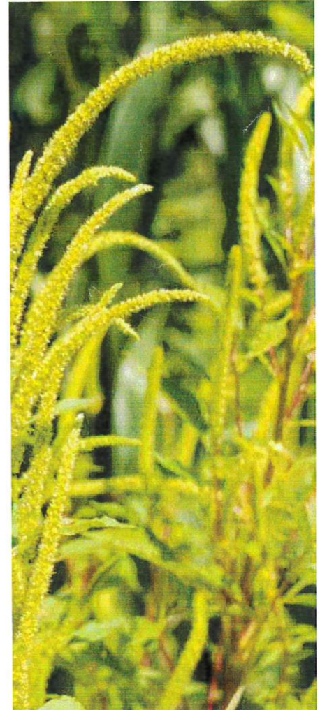
Palmer with long terminal seed head.