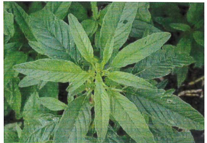
Waterhemp has long, narrow leaves.

For the latest information, visit www.ag.ndsu.edu/palmeramaranth