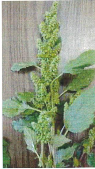
Redroot pigweed seed head.